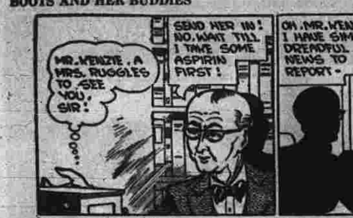
BOOTS AND HER BUDDIES